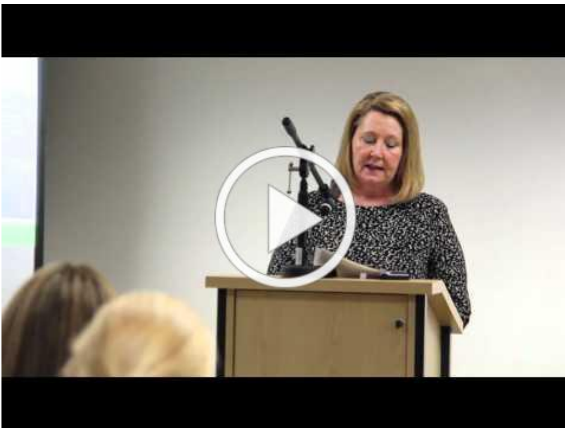
2015 Awards Highlights

NOVEMBER 9, 2015 -- In recognition of significant energy waste reduction investments and proven energy cost savings at facilities throughout the state, the Energy Service Coalition-Michigan Chapter announced five recipients of its annual Leaders in Efficiency award. The honorees at the Energy Service Coalition Fifth Annual Awards event included the City of Roseville; the Michigan Agency for Energy Michigan Public Service Commission; Monroe Metropolitan Wastewater Facility; the Village of Grosse Pointe Shores; and Wayne State University. Click on the photo below to play the video of the 2015 award ceremony.